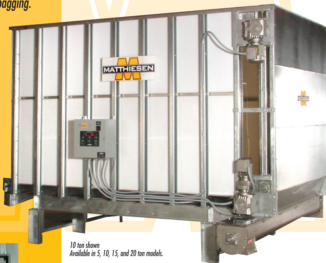
10 ton shown Available in 5, 10, 15, and 20 ton models.

Temporary storage of product is simplified with the Matthiesen Live Bottom Bin. The floor and front wall rake keep product moving so you can spend your time bagging.